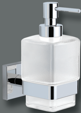
Wandseifenspender 300 ml